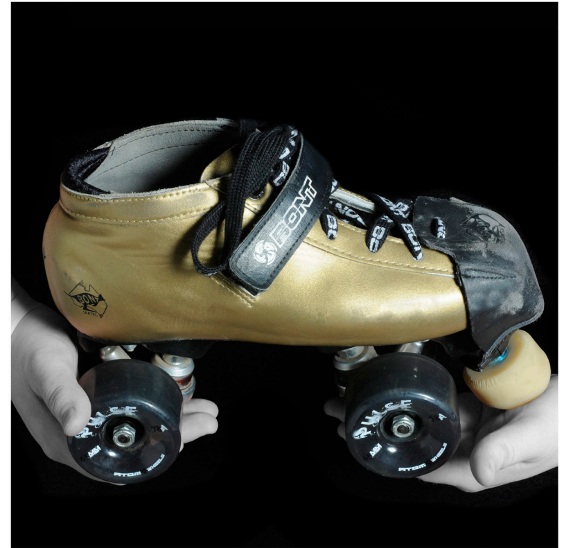
“That Gippsland can roll with the punches” Latrobe City Roller Derby