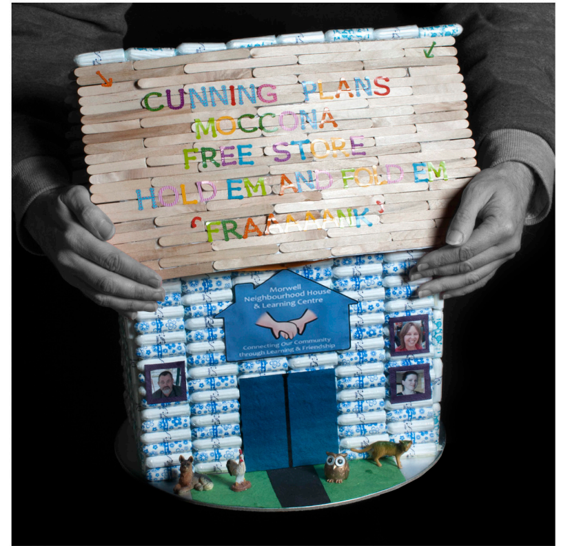
“Dignity and respect for everyone in the community” The Gippsland Period Project Team, Morwell Neighbourhood House