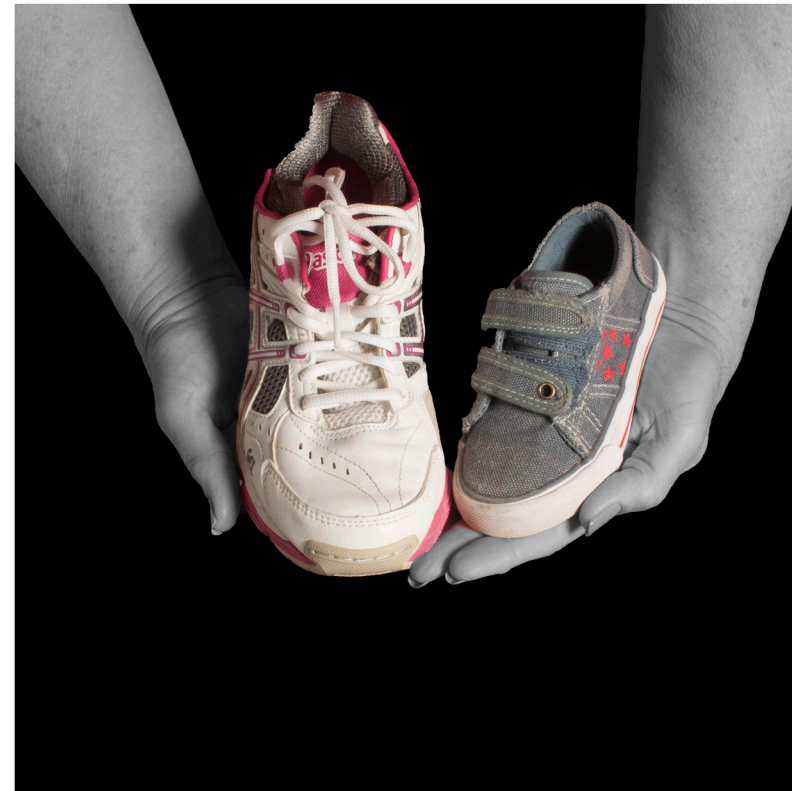
"Connecting the Morwell community through friendships and fitness" Rose Garden Walking Group