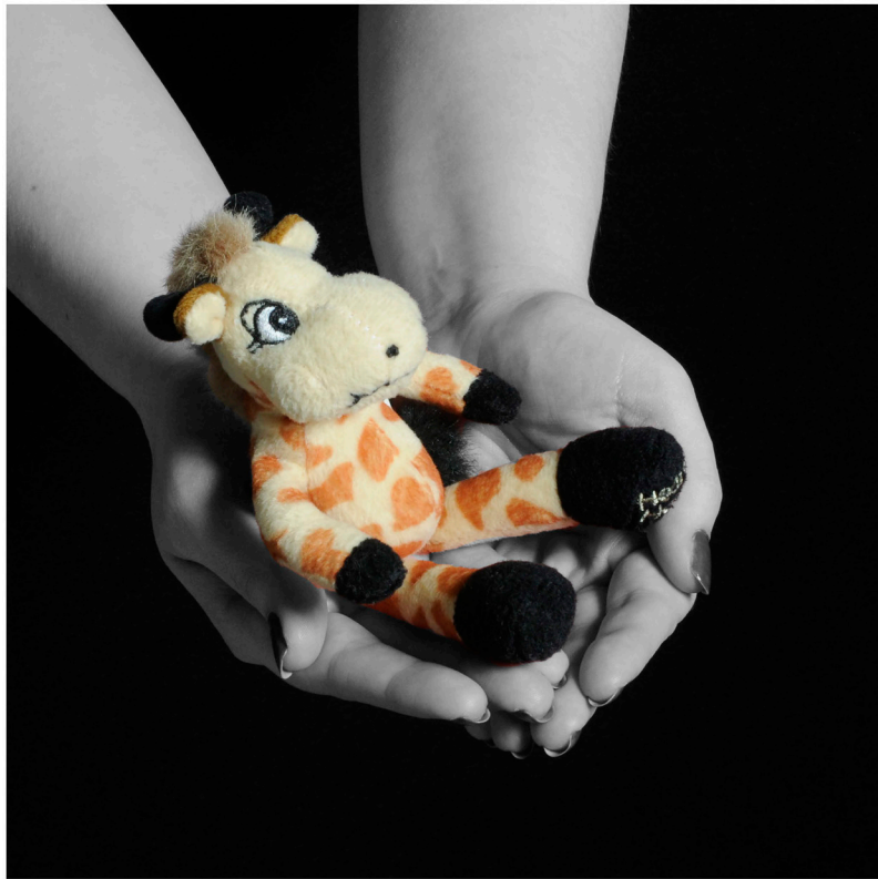
“Our dream is that all children in Gippsland receive Life Education” Healthy Harold – Life Education