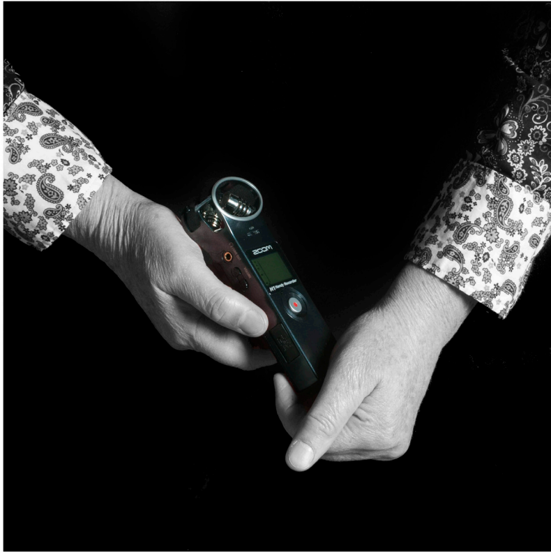
“That all the voices of Morwell are listened to and valued” Hazelwood Health Study: Community Wellbeing research team, Federation University, Australia