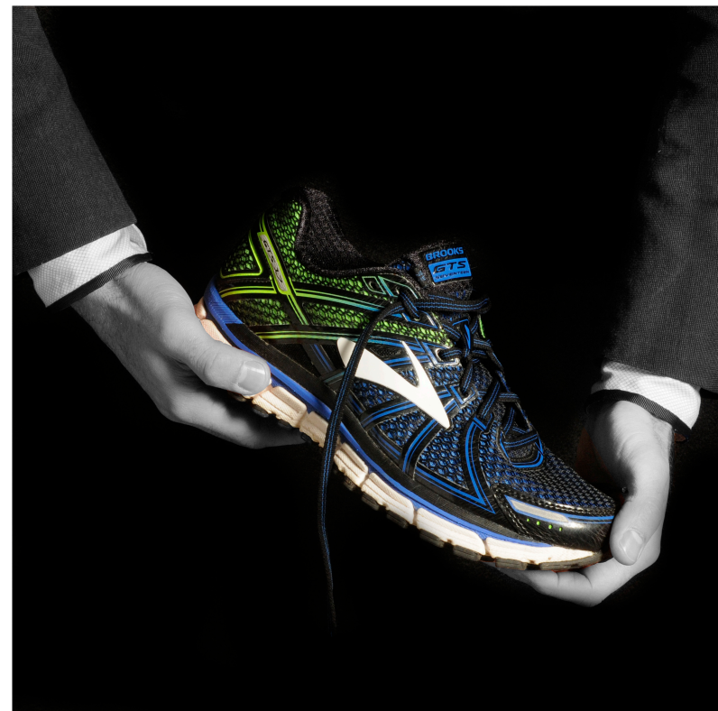
“An active future for Morwell, one that puts its best foot forward and a community that can think on its feet.”