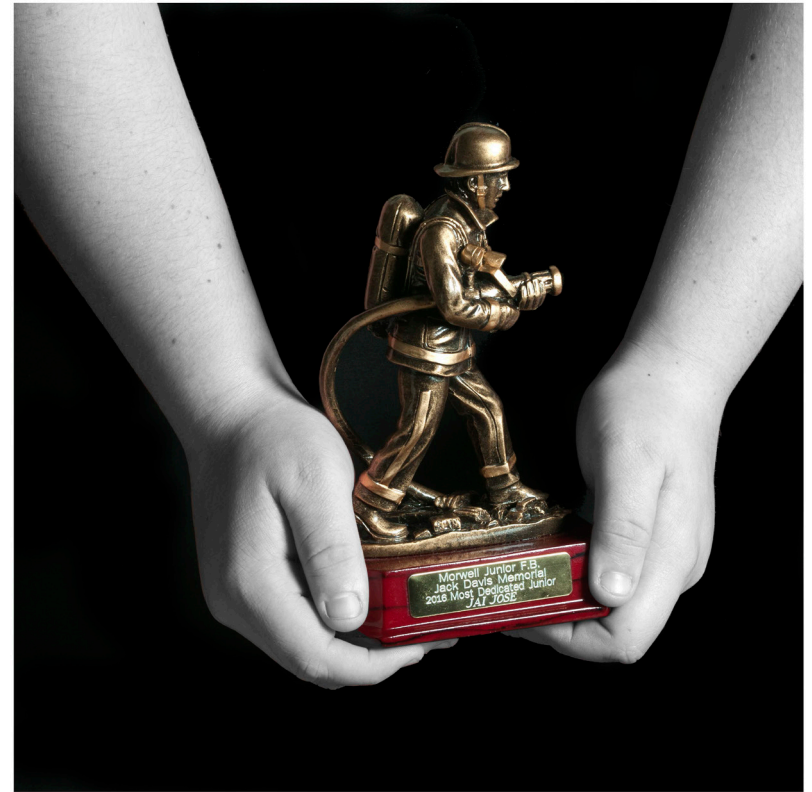
“For upgrades and improvements to make Morwell Fire Brigade even stronger” Morwell Junior Fire Brigade